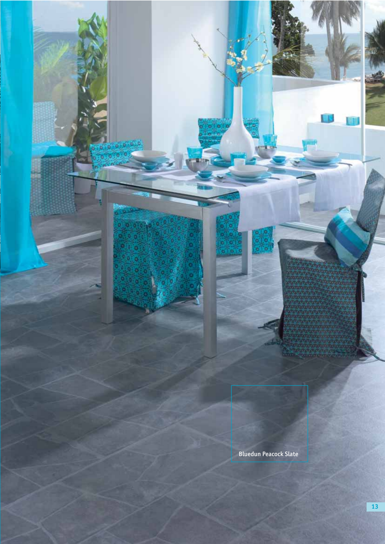
Bluedun Peacock Slate

Tarkett® Mallorca is a tantalising palette of broken stone that teases all appetites for a Southern European atmosphere. Subtly irregular, authentically textured, each design displays a varied and captivating blend of colours. Fiery and luminous, the predominant colour is punctuated with deeper accents for added contrast. Let the spicy vibrancy of Mallorca enter your home. Coming in large format, Mallorca is part of Tarkett® Generation XXLaminate flooring... With Tarkett® Mallorca , get the feeling of holidays at home. Everyday.